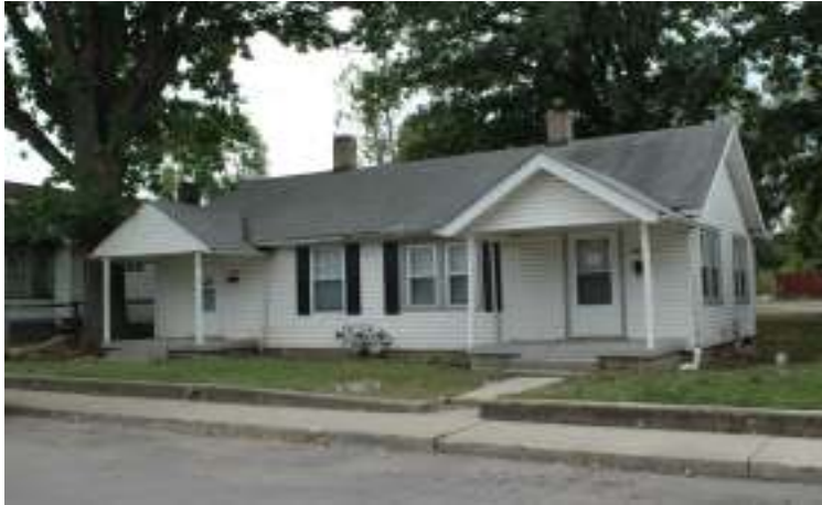
1615 Lawton Ave.